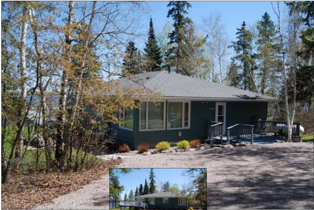
Thompson Lane Nutimik Lake