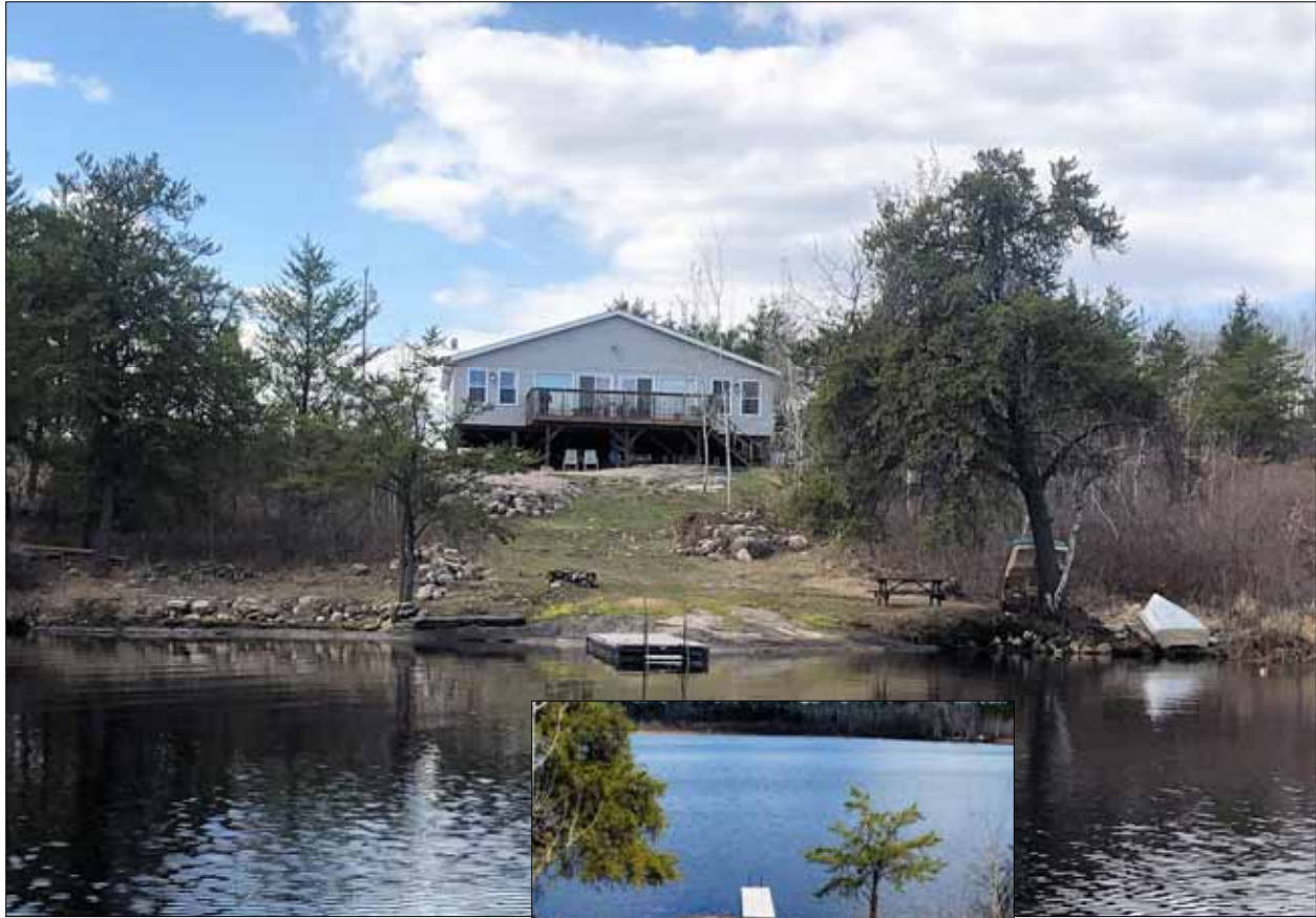
Brereton Lake Lakefront Block 5 Lot 2